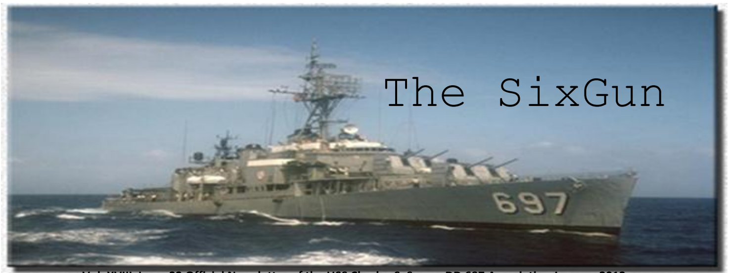
Vol. XVIII Issue 33 Official Newsletter of the USS Charles S. Sperry DD 697 Association January 2013